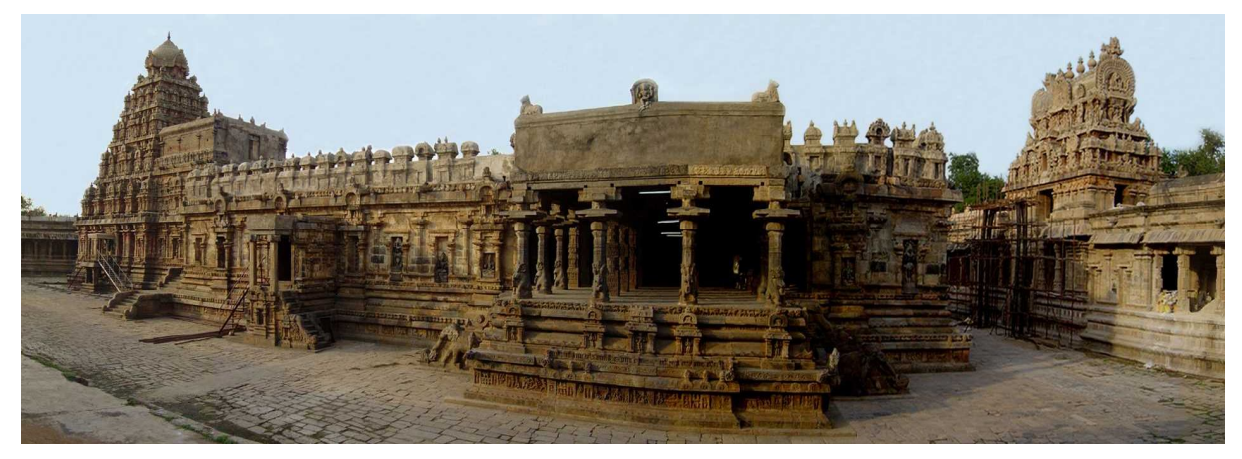
Figure 1. Darasuram Airavatesvara Temple Great Living Chola Temple( UNESCO World Heritage Site)

Two other Siva temples have also hymns sung on them by the Nayanmr and they are known as Kudandaik- Kilkkottam and Kudandaik karonam. The nagesvara temple is the most superb creation of chola art. It is possible that it was constructed by aditta chola (871-907 C.E.) who, the Sanskrit inscription say, studded the banks of the kaveri with thousand temples to lord Siva. . Historically, they have marked their local calendars with social events that celebrated important historical, religious and cultural events commemorating birth, marriage, death, the harvest, and salvation from peril (UNESCO, 2004). Kumbakoanm is centre round which we have five shrines called the pancha-krosa sthalas, shrines which are situated at a distance of five kroasa (about 11 miles). The shrines are Tirvdiaimarudur, Tirunagesvaram, Darsuram, swamimalai and pataivanam(karuppur) But unfortunately, proper literature embracing all aspects of our culture and history are not available in sufficient numbers, with the result that they are left to the mercy of ill informed men, who do not enlighten properly. And they return to their country with poor opinion of our land.