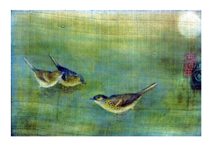
Plate 9: An example of the innumerable paintings of birds he drew