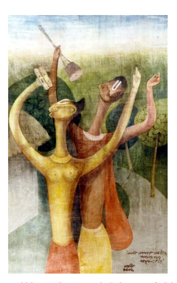
Plate 5: Maniklal, 1992. The verse reads, "Where can I find the beloved of my soul?"