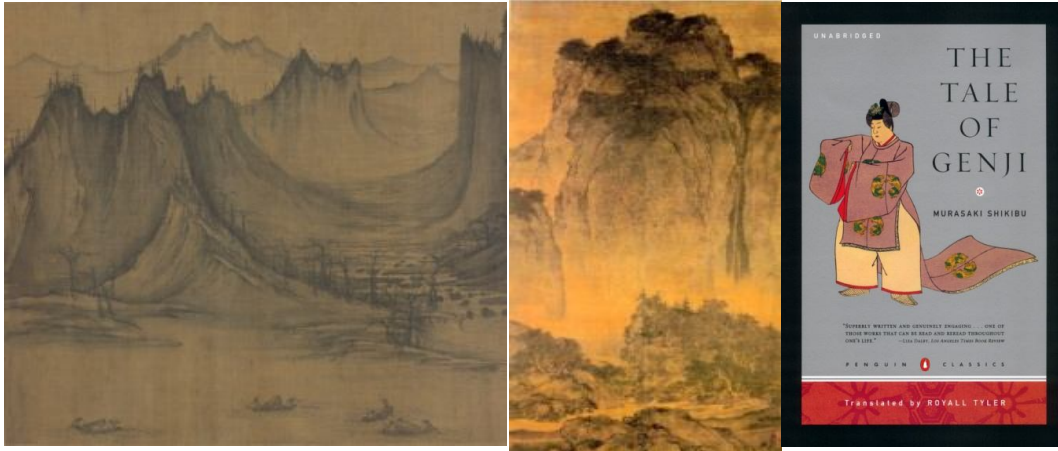
1. Artist Xu Daoning, Fishermen's Evening Song . 2. Artist Fan Kuan, Travellers Amid Mountains and Streams . 3. Author Murasaki Shikibu, Book The Tale of Genji .

and time. There is frequent depiction of roads or paths that seem to lead the viewer's eye into the work.