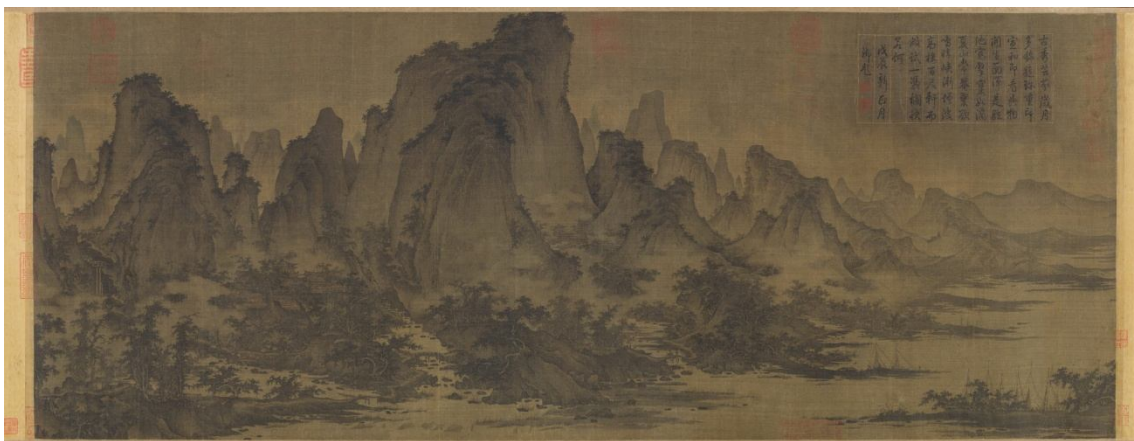
4. Artist: Attributed to Qu Ding (Chinese, active ca. 1023–ca. 1056), Northern Song dynasty (960–1127) Date: ca. 1050, Summer Mountains , Medium: Handscroll; ink and color on silk, Dimensions: Image: 17 7/8 × 45 3/8 in. (45.4 × 115.3 cm) Overall with mounting: 18 1/4 in. × 23 ft. 2 in. (46.4 × 706.1 cm), Credit Line: Ex coll.: C. C. Wang Family, Gift of The Dillon Fund, 1973

Only about 2 feet (0.6 metre) of such a scroll should be viewed at one time or the spirit of the work is violated. One problem faced by the artists was a need for multiple vanishing points in generating a sense of perspective, since the imaginary viewer was assumed not to be stationary. They solved this in a variety of ways, causing one perspective point to fade unnoticed into the next. Nearly contemporary with the Chinese panoramic landscapes are the Japanese emakimono , scroll paintings of the 12th and 13th centuries. These are long horizontal scrolls, 10–15 inches (25–38 cm) wide and up to 30 feet (9 metres) long. This painting tradition is called Yamato-e , or Japanese painting, to distinguish it from Japanese work in the Chinese manner. In the earliest example of this form, The Tale of Genji , Japan's great literary masterpiece, is shown in pictures alternating with text. Eventually the illustration in such works stood nearly alone, and typical subjects were the stories and biographies popular during Japan's Middle Ages. The Japanese taste for sensation and drama finds vivid expression in these scrolls. The buildings pictured in them are frequently without roofs, so that intimate interior scenes can be shown, and backgrounds are tilted forward so as to pack more incidents into a smaller space.