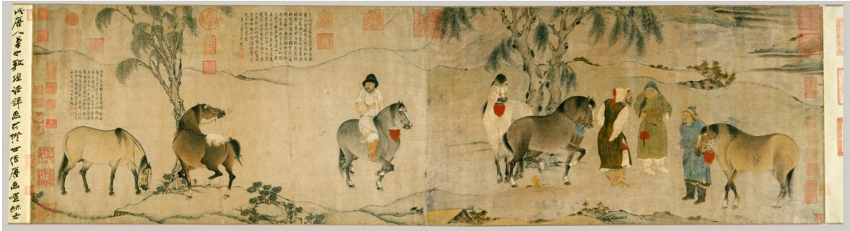
8. Artist: Unidentified Artists Chinese, 13th c. (1st half scroll); 14th c. (2nd half), Date: 13th–14th century, Six Horses, Medium: Handscroll; ink and color on paper, Dimensions: Image: 18 3/16 x 66 1/4 in. (46.2 x 168.3 cm), Overall with mounting: 18 9/16 x 254 3/4 in. (47.1 x 647.1 cm), Credit Line: Bequest of John M. Crawford Jr., 1988

flowers, animals, etc and they generally roll out from 6 or 8 feet to as much as 20 feet long. There are some examples of Chinese scroll Paintings.