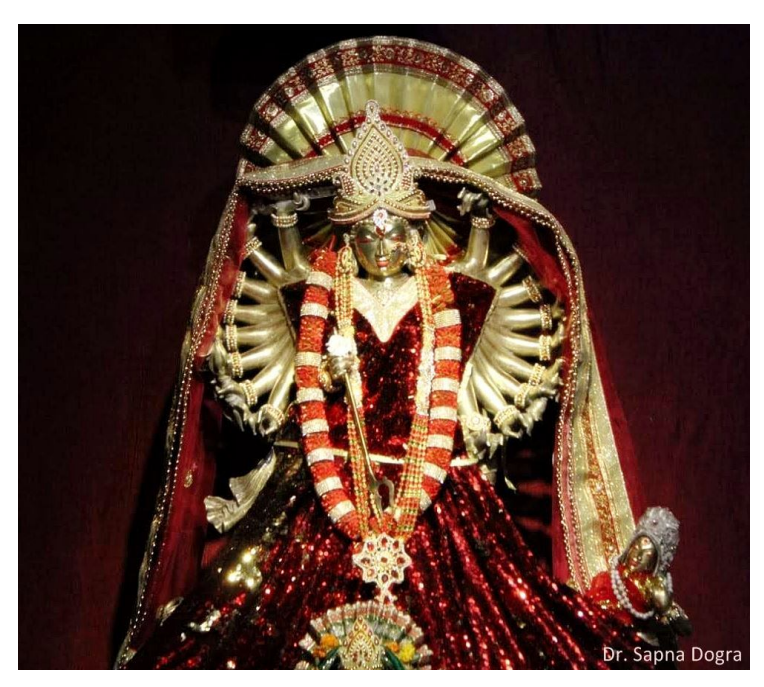
The idol of Goddess Durga placed inside the temple is made of metal.

Special prayers are offered in the morning and evening every day besides on special occasions and during festive seasons. Shri Krishan Janmashtami, Deepavali, Basant Panchami, Makara Sankranti, Maha Shivaratri, Vaisakha Sankranti and Shraavana Mondays are celebrated with zeal and splendour. Most important festivals are a major social and public event. The temple is also a popular meeting point for the students of Government Degree College and schools nearby. On Sundays, one can find innumerable families from villages near the temple premises.