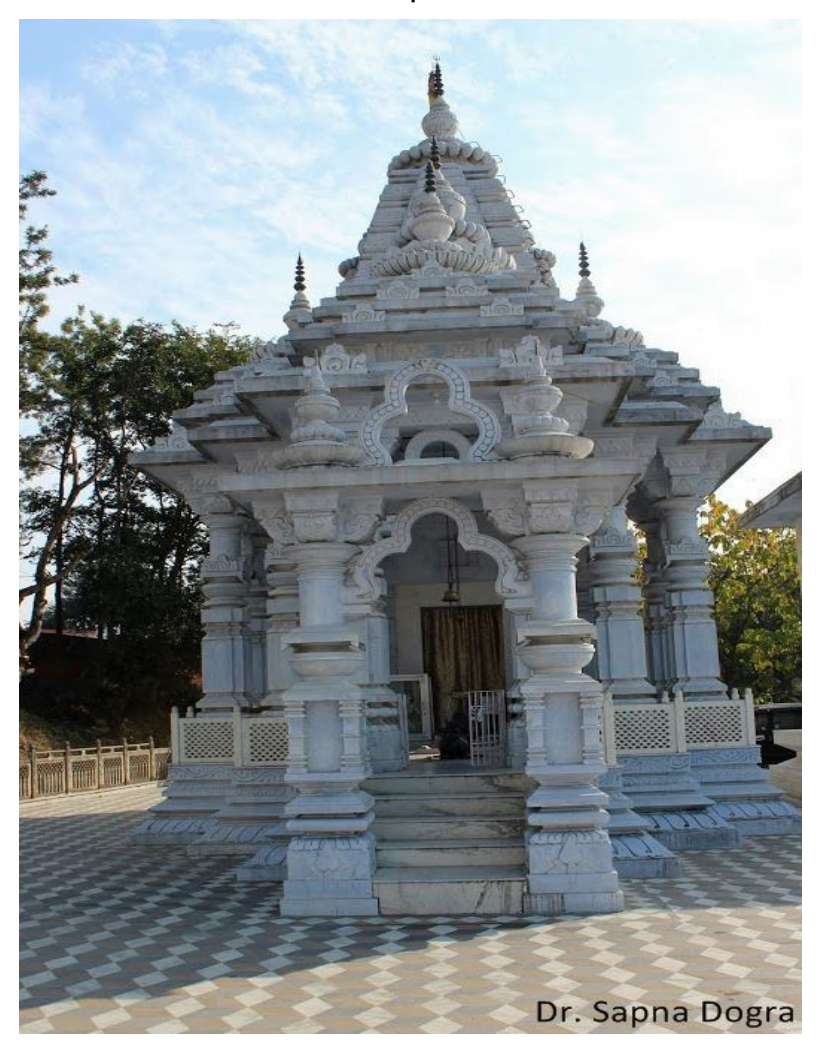
While the main temple stands in the temple premises, at the other corner, there is a temple of Lord Shiva.