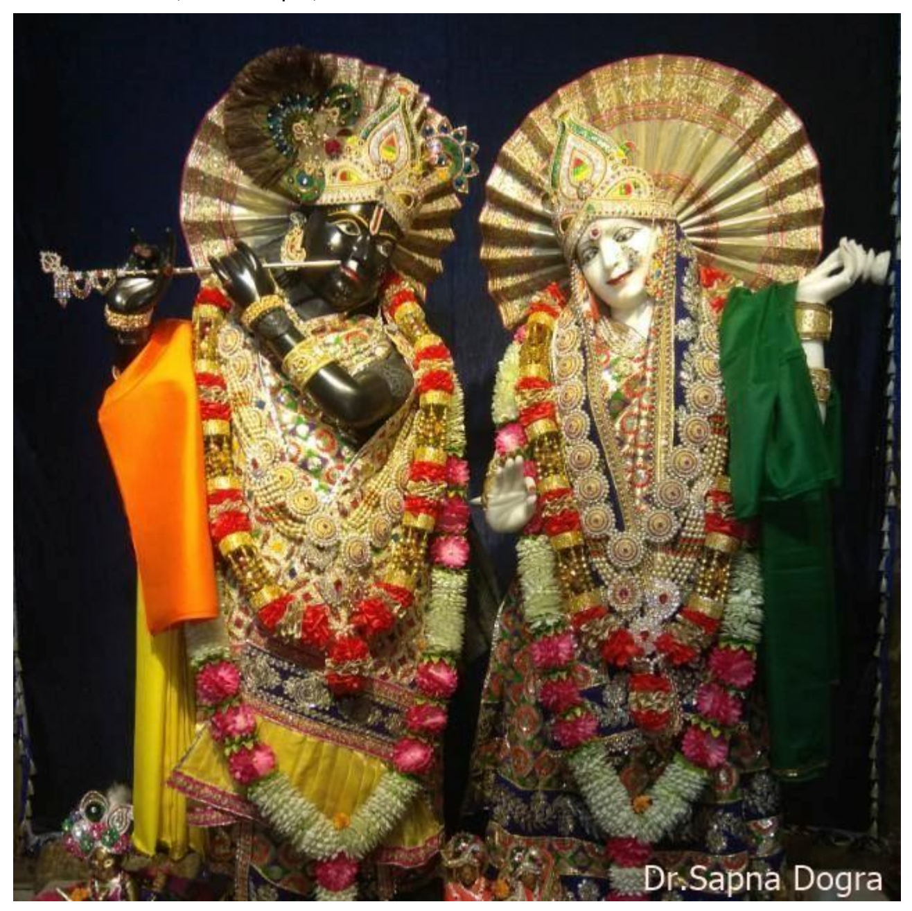
The marble idols of Radha Krishna placed inside the temple.

best place and is well connected to not only Baroh but all the major towns and cities of Himachal Pradesh, like Hamirpur, Chamba and Dalhousie.