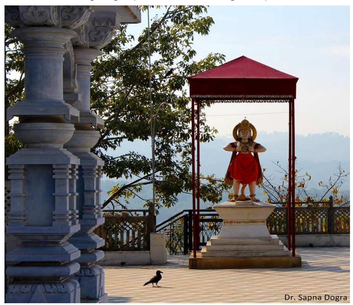
A Lord Hanuman idol in the temple premises.

Though the weather in Kangra is quite pleasant throughout the year, a few months of summers from June till September can be oppressive because of the soaring temperature. The best time to visit the temple is in the month of October during the Dussehra festival which is celebrated with great gaiety and fervour in the Kangra Valley.