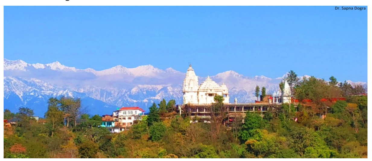
Distant view of the temple surrounded by the breath-taking snow-capped Dhauladhar range of the Himalayas.

Radhe Krishna temple of Baba Baroh is the most famous pilgrim spot for the rural population. A lack of hotels, guest houses and restaurants in the area are some of the reasons that this temple is not on every traveller's list that comes to Kangra. A large number of other smaller temples can be found around Baroh but are of negligible historical and architectural importance. At present, one big marble temple is standing here and is spectacular in beauty. The breathtaking beauty of the temple can be gauged by the fact that the temple (made purely of white marble) stands tall atop a hill surrounded by snow-capped Dhauladhar range around it.