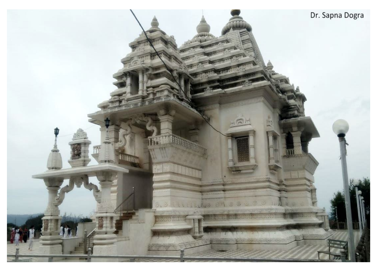
The entrance to the temple as one enters from the Baroh bus stand.

Baba Baroh temple is not only visited for its religious importance, but also for its scenic surroundings. The temple commands a panoramic view of the Dhauladhar ranges. Mesmerizing views of the sunset is an added attraction, making it a preferred spot for the whole family. The temple is very clean and well maintained.