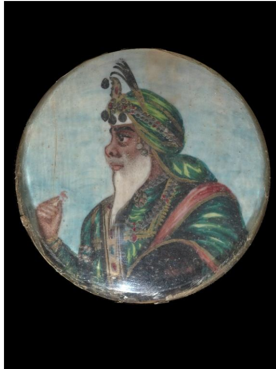
Figure 8: Maharaja Ranjit Singh. Artist unknown. Lahore. Ca.1850-ca.1870. Painted on ivory. Acc.no.IS.167-1954, Victoria and Albert Museum.

One of new elements of this phase is an introduction of many ivory paintings ( Figure 8 ). One of fourteen ivory painting shows Ranjit Singh facing left in profile in a bust portrait. The supporter is cut roundly. Maharaja is wearing a green headgear and dress. He is holding a flower between his thumb and finger. Also, it seems that he has a black shield by his left hand. His beard is painted completely in white. His face is portrayed very realistic and, in particular, the depiction of his nose is sophisticated; its bridge line is exquisite and its swelling is naturally rendered through some shading. However, this portrait has a contradiction or error in his iconography. Ranjit Singh is known as his left eye being blind and covered by an eyepatch. The image does not follow such an actual appearance. Although Victoria and Albert Museum illustrates this portrait as Company Painting from Lahore, it may include some factual error. If this is a Company painting or made by an Indian local artist, he seems to have lived outside Lahore such as Delhi. If this was produced in Lahore, the artist is not local but alien i.e. British. Otherwise, Lahore local painter may delete Ranjit Singh's eyepatch deliberately for the aesthetic reason. If so, this 'imaginary' portrait shows a new attempt unprecedented in the early 19 th century.