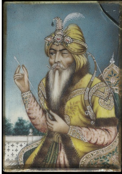
Figure 9: One of Two Portraits of Maharaja Ranjit Singh (1780-1839). Artist unknown. Delhi. Ca. 1900. 6.5×3 cm. Watercolour on ivory. Acc.no. IS.524-1950, Victoria and Albert Museum.

In this painting ( Figure 9 ), Ranjit Singh who has a white beard and faces left in three quarter view is sitting on a European chair that is finely decorated with colourful stones and has a floral design on the top. He is wearing a yellow turban attached with a white feather and a sort of crown decorated with colourful stones. He is also wearing a yellow jacket in which edges are attached with brown furs. His inner dress is painted in yellow with dots and its sleeves are decorated with floral patterns. He is holding a stick in both hands and a silver-and-brown bow is hung from his left shoulder. On the bottom left, the white lattice works are rendered under which a green trees are depicted. The background is gradually painted in blue towards the top.