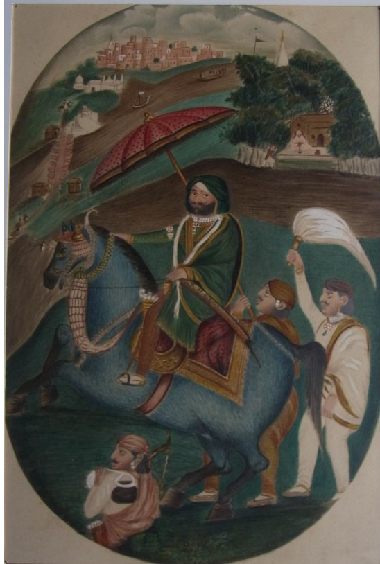
Figure 5: Ranjit Singh Heading to the Lahore Castle. Possibly by Imam Bakhsh. Lahore. 2nd quarter 19th century. The Punjab Archives, Lahore.