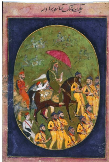
Figure 1: Maharaja Ranjit Singh on horseback. Punjab. Ca.1830-1839. Opaque watercolors on paper. 16.5(19.05)×11.4(14.6) cm. Acc.no.1998.98, Asian Art Museum, San Francisco.