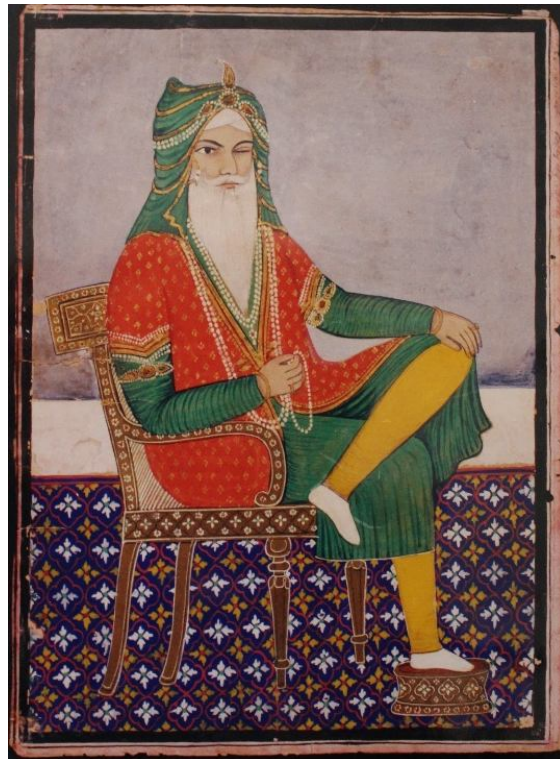
Figure 7: Maharaja Ranjit Singh. Artist unknown. Punjab. Ca.19th century. Watercolor on paper. 13 5/8×10 11. Acc.no.2386, Government Museum and Art Gallery Chandigarh.