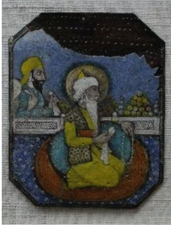
Figure 10: Maharaja Ranjit Singh. Artist unknown. Punjab. ca. 1900. 10.3×8.2 cm. Painted metal with meena work. Acc.no. 96.198, National Museum, New Delhi.

In this painting ( Figure 10 ), Ranjit Singh who has a white beard and faces right in profile is sitting with his legs folded on a red cushion. His head is encircled with a halo painted in gold in which the border is shadowed. He is wearing a yellow turban tied with a white bandana as well as a yellow dress under a golden jacket with black dots. He is leaning against a green pillow while holding a white handkerchief in his left hand and a white rosary in his right hand. The floor carpet is painted in blue and decorated with floral patterns. Beyond the white lattice works, an attendant who has a black beard and faces right in profile is standing on the left hand side. He is wearing a yellow turban and a blue dress while holding a white fly whisk in his right hand and a white handkerchief in his left hand. Green trees with a lot of colourful flowers are rendered. The background is painted in blue.