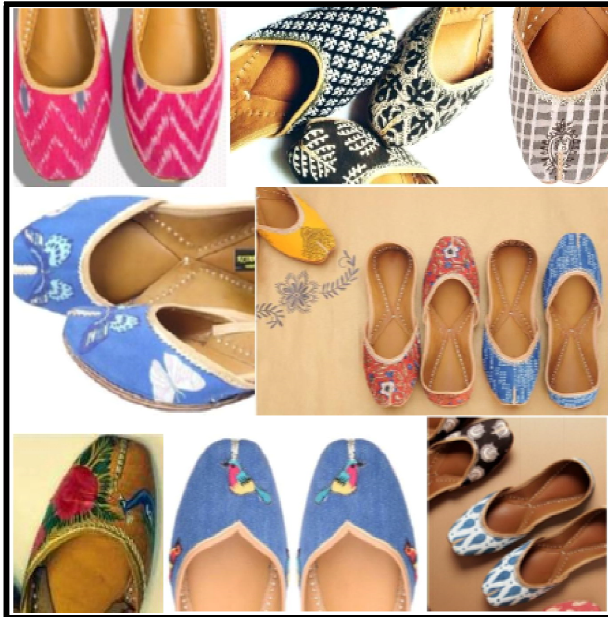
Figure 4: Traditional prints used for footwear

like cheerily tapestried elephants, blinds, fans, twirling peacocks and the ample shaded parrots (Chattopadhyaya, 1964, 6).