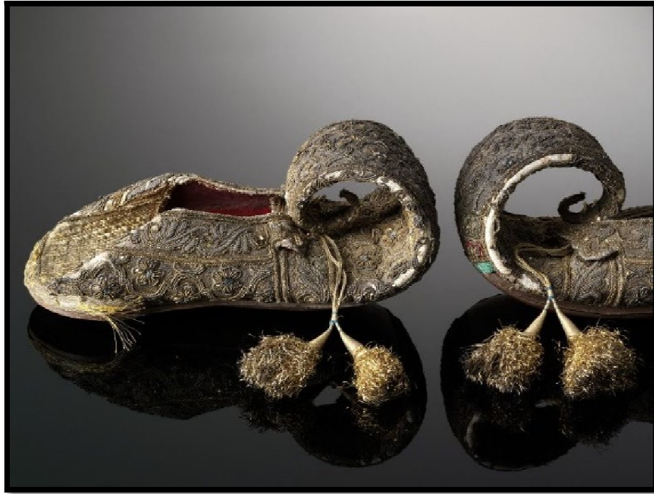
Figure 1: Zardozi footwear, Source: Victoria and Albert Museum, Museum no. 0515(IS), Lucknow, 1855.

form of customary racial footwear. Innumerable treatments were widespread in zardozi work (Chattopadhyaya, 1964, 10).