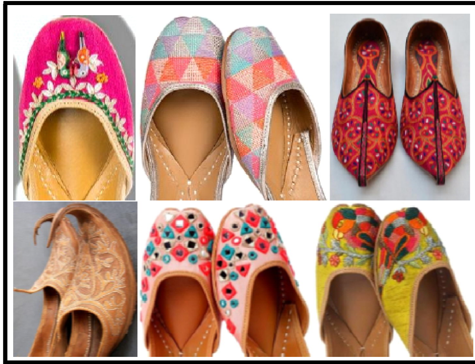
Figure 3: Regional Embroideries and Designs

grounded on the different patterns which offers the particular design its appellation. The remarkable fact is that with the skillful manipulation of the darning stitch so miscellaneous ranges of intricate designs are shaped, with an entire effect of floral grandeur (Chattopadhyaya, 1964, 6).