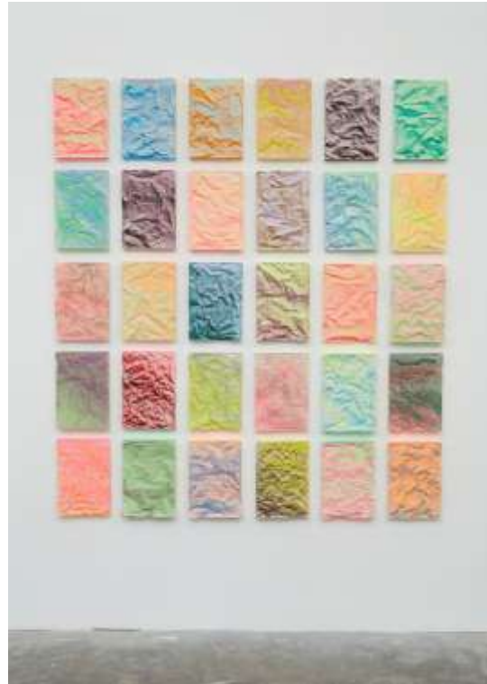
Fig 1 Rana Begum, No. 897 Casts, 2019, Jesmonite,