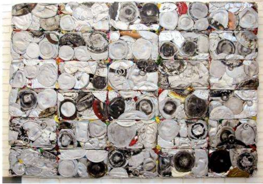
Fig 3 Subodh Gupta Cosmos VIII, 2009 Fig 4 Untitled (2015) by Subodh Gupta, in aluminium, fabric and resin Details from Gupta's installation Dada in NGMA in 2014