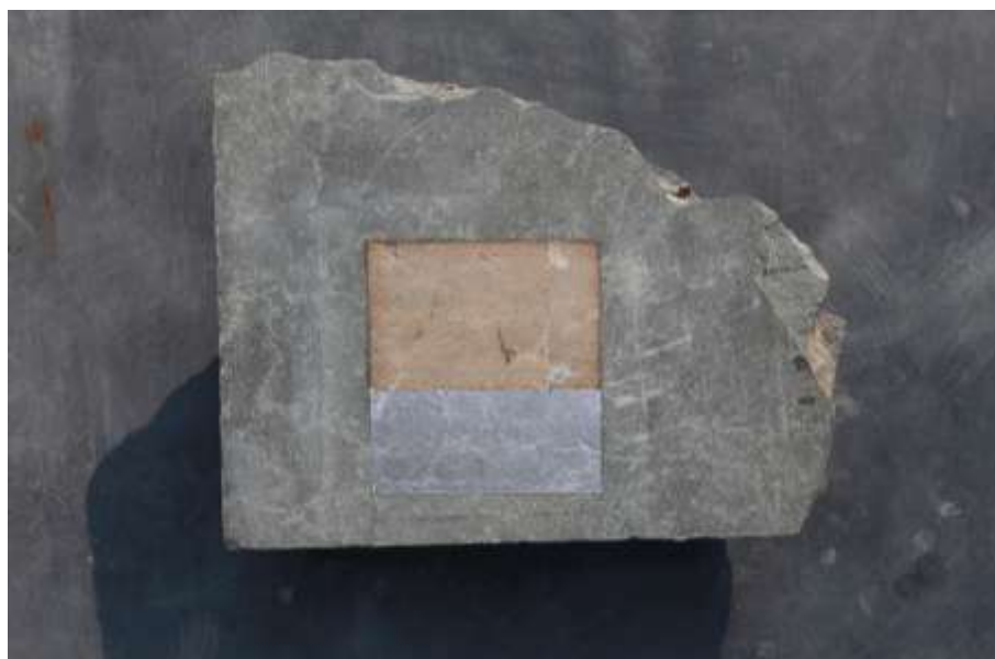
Fig 6 Tanya Goel, Aluminum, Silver Leaf Studies #4 Aluminum, lead, silver foils on compressed concrete

We can see similar exploration in the work of contemporary Indian artist Tanya Goel (b. 1985). Her works would be categorized loosely as minimalist painting in the style of geometric abstraction. One series of her painting is particularly worth analyzing in the light of the sensory appeal of material.