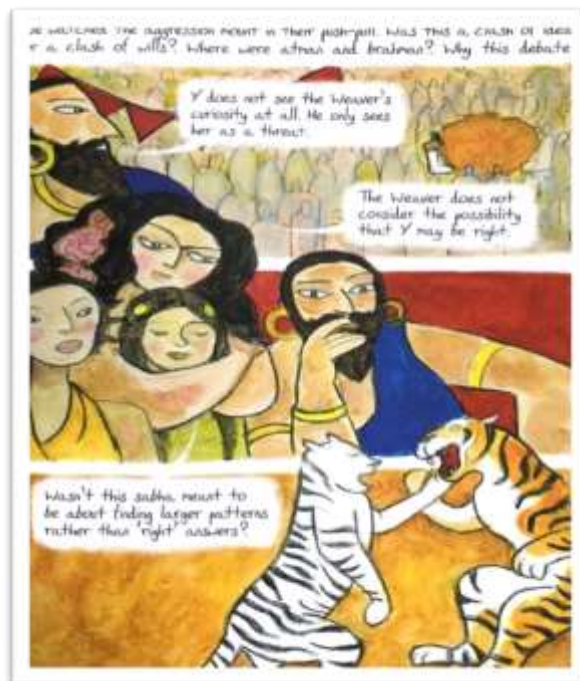
Illustration 4: The debate between Yājñavalkya and the Weaver (Patil & Pattanaik, 2019, p. 145)

distinctive frames juxtaposed to depict fire as a twofold metaphor: (a) the art of “yagna” (the holy-fire) performed by Yājñavalkya in his classroom as part of the methodological practice of early Vedic knowledge, and (b) the use of fire in Katyayani’s kitchen to perform daily household chores (Patil & Pattanaik, 2019, pp. 126-131). Fire becomes the symbolic expression of early civilisations, having the twin purpose of satiating the basic hunger for knowledge and for food. The two frames bring a unique juxtaposition and a distinctive aspect to the approach of Yājñavalkya and Katyayani. Fire appears as a mythological figure with an open-mouth in Yājñavalkya’s classroom while performing the ritual of “yagna” (see illustration 3 (a)). In Katyayani’s life, fire becomes amiable through the use in cooking food. Patil and Pattanaik have used the term “sutra” in illustration 3 to stitch the dialogues of the tale into a thread (Patil & Pattanaik, 2019, p. 168). The text is dialogic in its structure. Similarly, each frame in the graphic novel is engraved with “Vedic” thoughts and expressions. 9